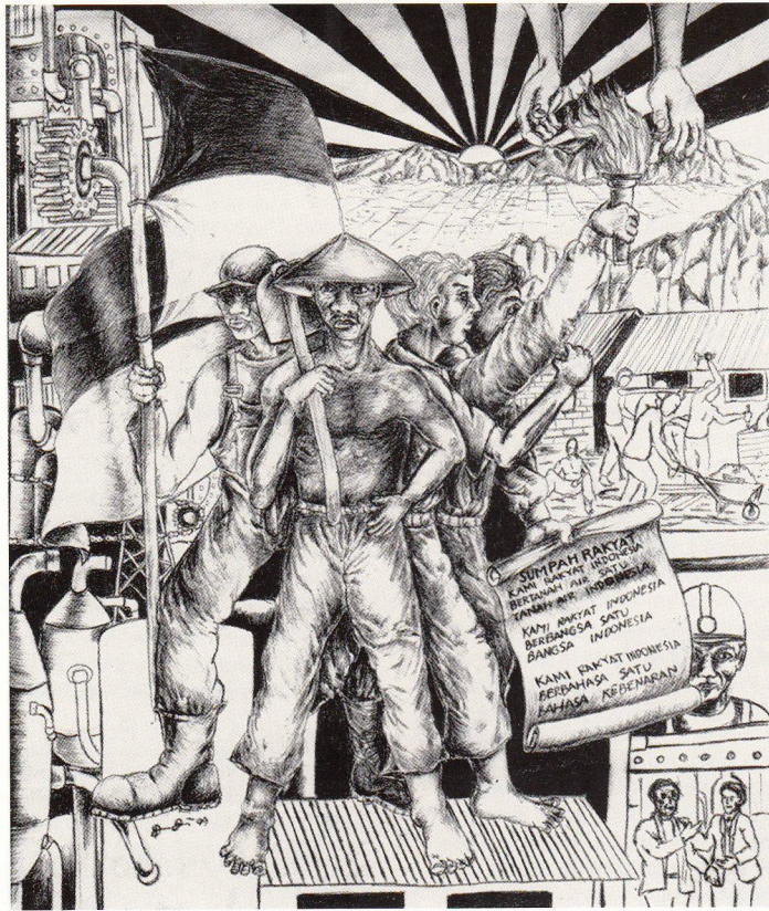
Dodi, Irwandi. Sumpah Rakyat (People's Oath) , 1999, ink on paper, 19.7 x 16.5