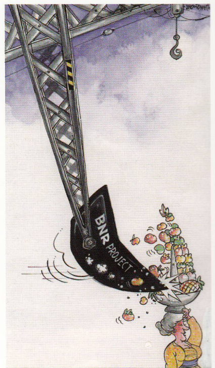
Paramartha, Kadek Janggo. BNR, 1995, ink and watercolour on paper, 23.0 x 13.5