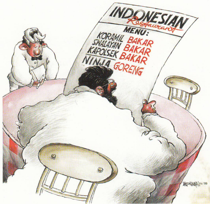
Paramartha, Kadek Janggo. Indonesian Restaurant, 1998, ink and watercolour on paper, 30.0 x 38.0