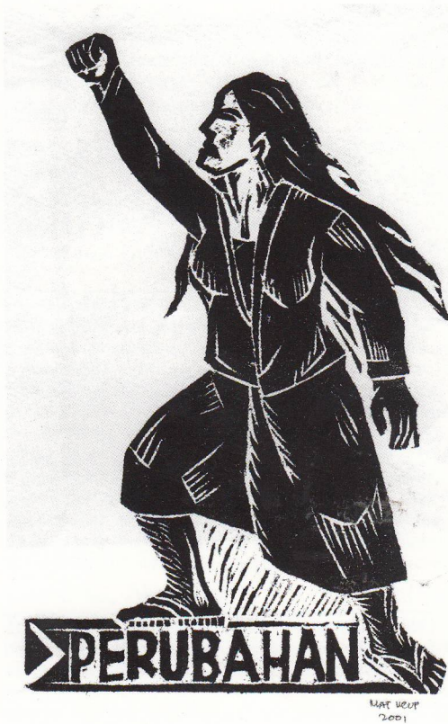
Ucup, Mat. ' Perubahan ' [Change], 2000, reproduction print on paper, 28.0 x 20.0