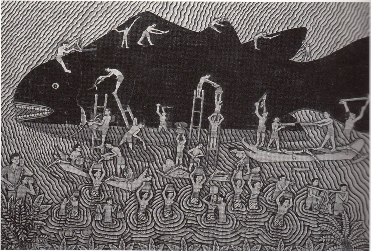
Rai, Ida Bagus Nyoman. The Beached Whale , 1978, pastel and crayon on canvas, 110.0 x 154.0