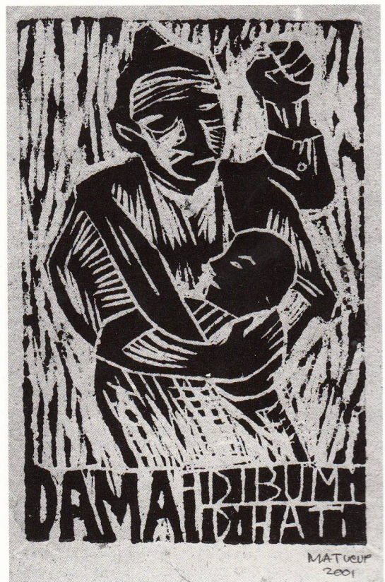
Ucup, Mat. ' Damai di Bumi, di Hati ' [Peace on Earth, and in the Heart], 2000, reproduction print on paper, 17.5 x 13.0